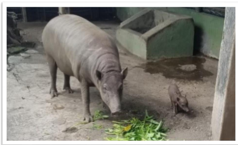
1-month-old male babirusa piglet with mum Kirana, born on 26 February 2020 at Surabaya Zoo.

implementing the second set of breeding and transfer recommendations published in 2018.