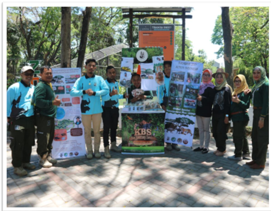
Action Indonesia Day 2019 at Surabaya Zoo.

We need your help to get as many participants as possible raising awareness for Babirusa, Anoa and Banteng! Find out more about how you can join in on the GSMP website http://www.actionindonesia.org and look out for our Action Indonesia social media pages coming soon!