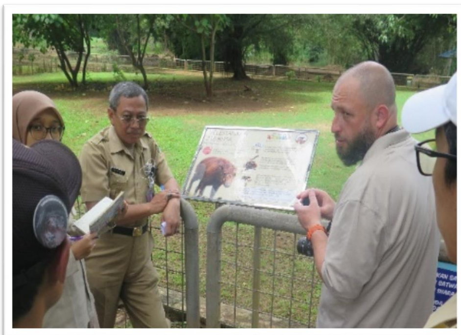
Discussing babirusa husbandry at Ragunan Zoo

A huge thank you is in order for all the individuals and facilities that participate in or fund Action Indonesia and the GSMP programs. We look forward to many more years of collaboration and success for these species.