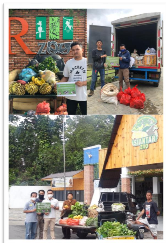
R Zoo & Park, Lembang Zoo & Park and Siantar Zoo receiving donated supplies

Bank : BNI Branch : Pasar Mayestik Account Name : Perhimpunan Kb. Binatang Se Indonesia Account number : 955955206 Swift Code : BNINIDJAPMK