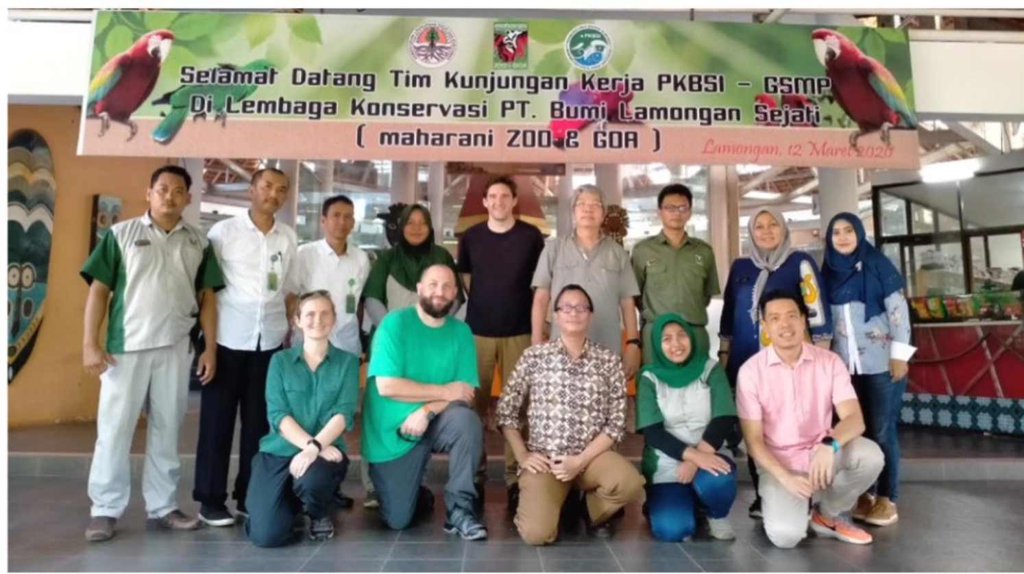
PKBSI-GSMP visited Maharani Zoo & Goa during the zoo visits in March

that were made during this visit will help to facilitate the cooperative breeding of these GSMP species into the future. Thank you very much to PKBSI for organising the visit and to all the zoos that hosted us!